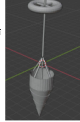
Zaïral, Figure 1

biodegradable frame that allows it to maintain its shape throughout the process. In this form, individual farmers can easily produce Zaï holes. However, the instrument can also be situated within a larger system (see Figure 2), allowing for multiple Zaï holes to be produced simultaneously without the use of manual labor. This system utilizes solar power to electrically lower five instruments, screw the holes, and distribute the compost. Although the latter situation's efficiency is preferable in most environments, it may not appeal to some subsistence farmers, and may not be possible in some countries due to infrastructural limitations. The Zaïral can be therefore utilized in any environment to reverse the effects of desertification, and the freedom of choice in seeds ensures that cultural and environmental differences across the world are accounted for.